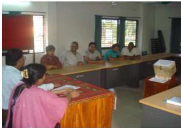
View of opening session of tender box

Some items we have purchased locally from Keshabpur. All purchase made by collecting open quotation at least 04 or more with specimen of the goods incase of need by circulating tender notice, those which the bidders submitted in locked tender box and specimen box. The tender and specimen were opened in presence of all member of the purchase committee, representative from Concern Worldwide, Bangladesh, Bidders and other guest,, analyzed the rate and specimen of the dropped quotation considering caring cost, distance, packet and packing cost, loading and unloading cost, quality of goods, easy to supervision/follow up and have ability to supply the required items and quantity as per desired date/time and finalized of the feasible and potential vendors. Then issued result sheet, work order to their individual name by mentioning date, time and place to supply the goods, prepared and signed memorandum of understanding on non-judicial stamp with price of Tk.150.00 among Samadhan and suppliers. In 1 st and 2 nd phase of the relief program Samadhan followed same procedures to procured all items and quantity of relief goods.