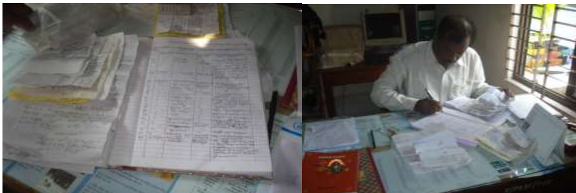
View of documentation by monitoring officer of the papers found in complain box

To ensure the aforesaid ideality Samadhan management has been assigned other staff except implementation staff for time to time monitoring in every levels of implementation process like in procurement with quality and quantity, packaging with right measurement, identify and select comparatively more vulnerable persons etc. Based on the findings every after sunset from 9.00 PM to mid night was the scheduled meeting time and or need based time was selected, where the senior officials of Samadhan given feedback to the right person for right action and rectification. Even though we have discussed in-groups (Forum) to find out better ways to overcome of any barrier/challenges/constraints found in the field accordingly. Besides that one representative from Concern was full time assigned for monitoring, from whom Samadhan received feedback positively and taken necessary steps to overcome any gap/lacking/mistake/shortage found in field.