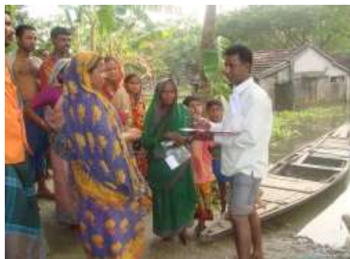
View of need assessment over area