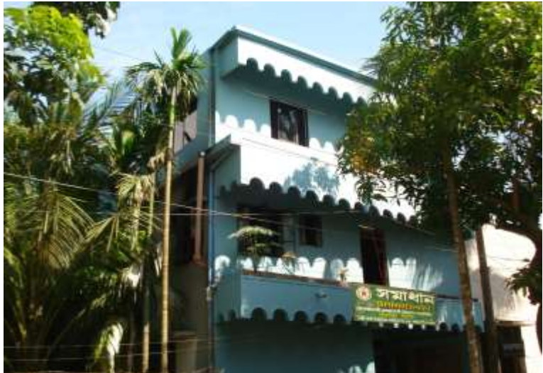
View of Samadhan Office building