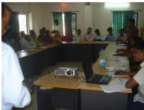
View of HAP training conducted by Concern

Developed partnership among Concern Worldwide, Bangladesh versus European Commission Humanitarian Aid Office (ECHO) first and again another partnership approach in between Samadhan and Concern Worldwide, Bangladesh was friendly, mutual respect, having prior dignity and trust among each other, bearing responsibility jointly by giving high priority to the disaster victims to ensure food security. This is the first time partnership experience in the light of Humanitarian Accountability Partnership (HAP) of Samadhan to work with Concern Worldwide, Bangladesh .