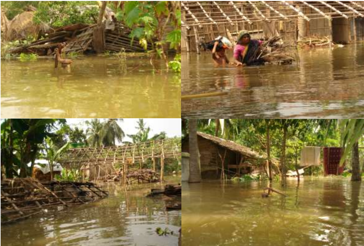
View of hazards over Keshabpur and Monirampur upazila

Out of those areas Trimohini, Sagordari and Biddanandakati union under Keshabpur upazila and Maswimnagor, Jhampa and Hariharnagor union under Monirampur upazila in Jessore district are stand on the bank of Kopotakkha river, causes of which the areas are hazards prone and different hazards made disaster round the year, especially waterlogging is the common hazard caused for disaster. There were rainfall and huge rainwater was coming down from upper stream of Kopotakkha River in the end of the last week of September '2008 as we observed. As a result huge water overflowed and interred into the adjacent villages, damaged and washed-out of different embankment, which was turned into serious disaster of "flood", and then it is turning into permanent waterlogging. The Flood 2008 was completely different than previous year i.e. it has been broken all previous records of flood/waterlogging at least 3 to 5 feet of high water level found than previous year, the upper stream water was coming down and river water was increasing day by day, as the river has been silted in lower part and that is why the surplus water can not drain out, thus the river and community areas were over flooded, inundated houses, roads, embankments, education institutions, markets, other common places, 100% of the cropped lands and betel-leaf farm.