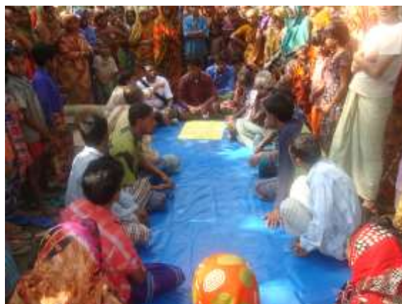
View of public events (FGD)