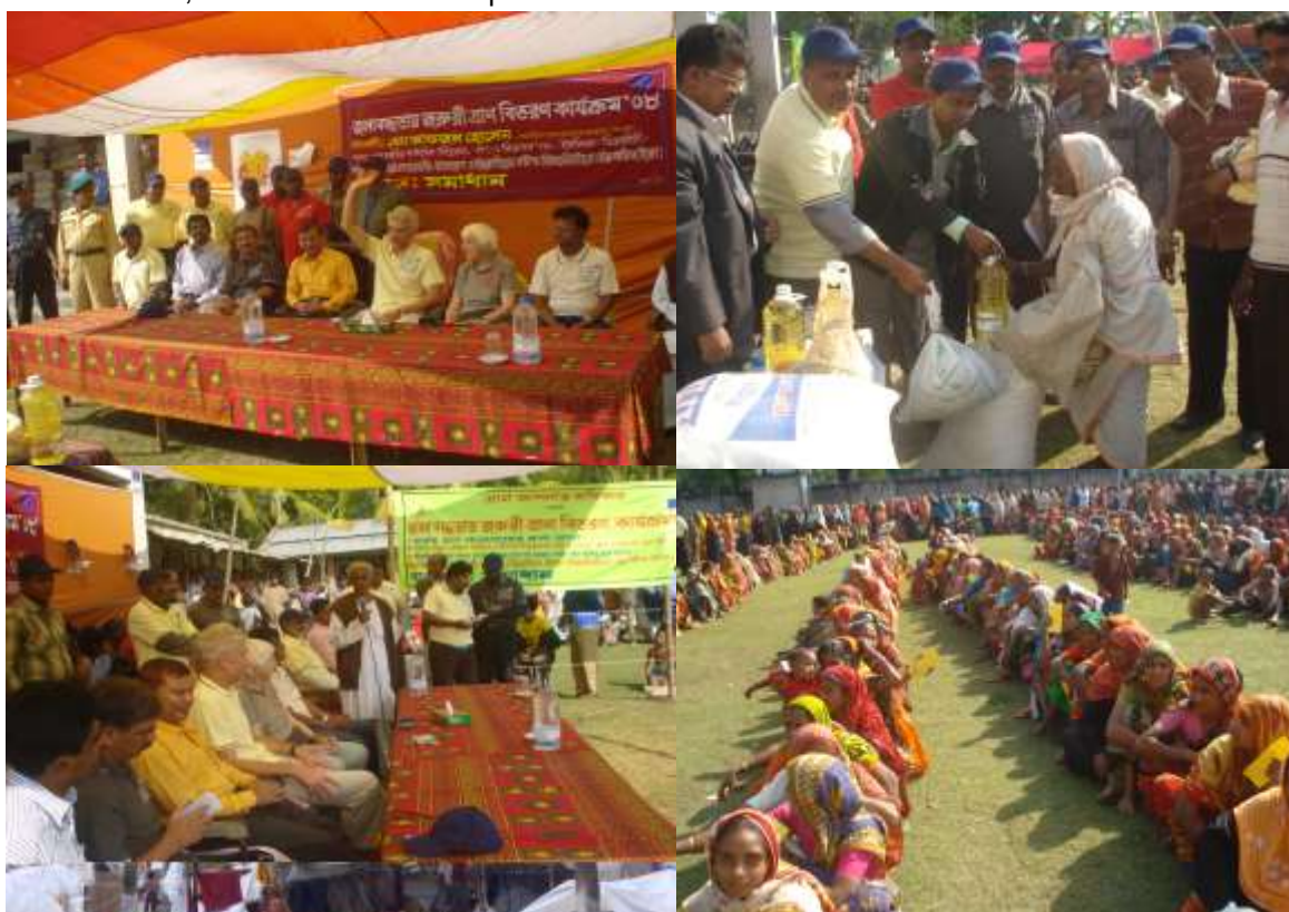
View of inauguration session of waterlogging relief distribution'2008-09

During distribution the Chit card holders made line by village and total of 04 booths we opened for distribution at a time. In the distribution after checking and signing of Chit card it's given back to the beneficiaries for second time and in second distribution closed all the cards from the distribution center. In first, second and extended phase of relief distribution we have used same school filed.