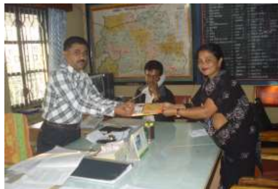
View of papers handed over to UNO Minirampur by the Project Officer Concern

Most of the time written communication and coordination done by using fax, e-mail, mobile, T&T phone and hard copy of the letter with Concern Worldwide, Bangladesh, DC, ADC (General) UNO, PIO, Tag Officer, Union Parishad, Journalist, goods suppliers and other stakeholder. Other than that local communication and coordination done with community people by individual contact and discussion, setting complain box, Banner, festoon, awareness banner, Stickers, Chit card, focused group discussion, large group