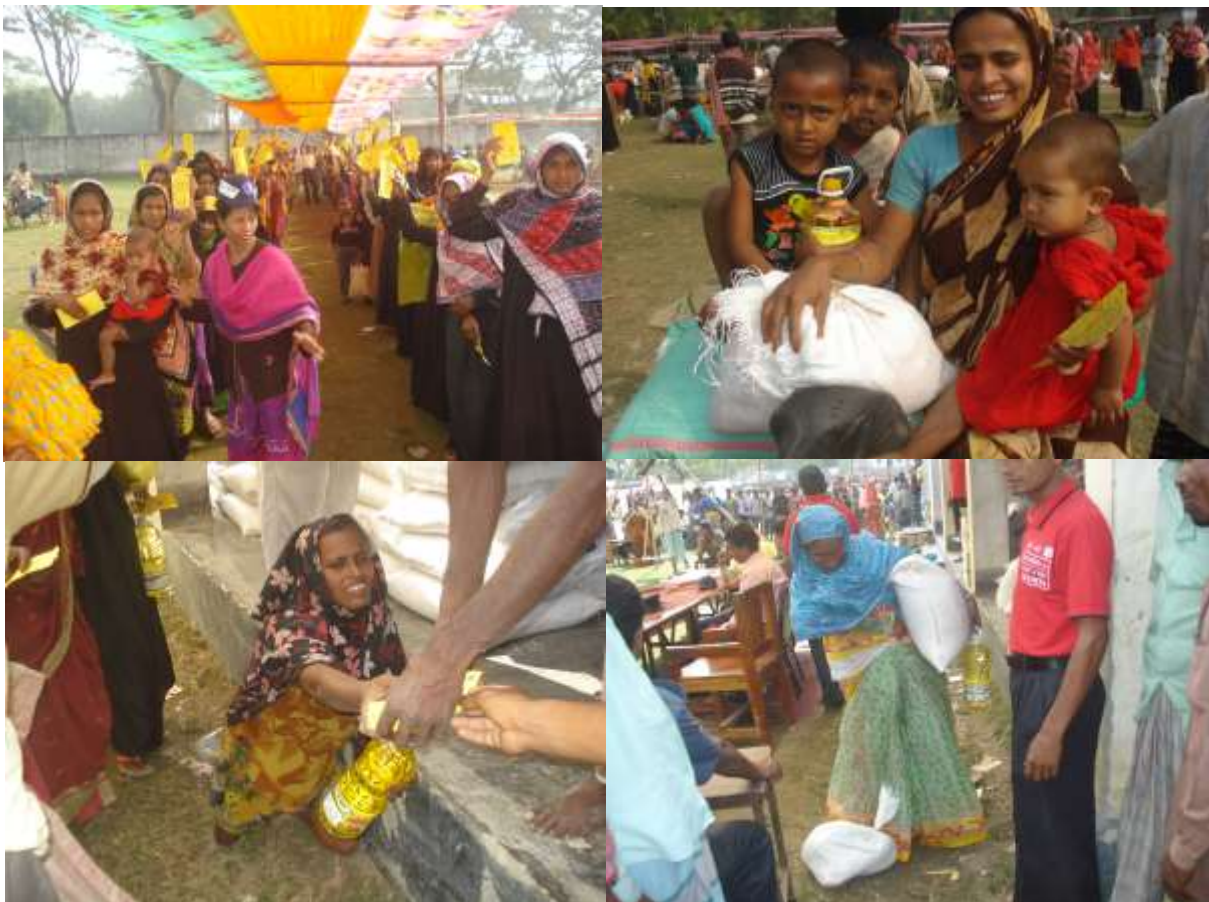
View of people is coming to receive relief by row & receiver going out with relief goods