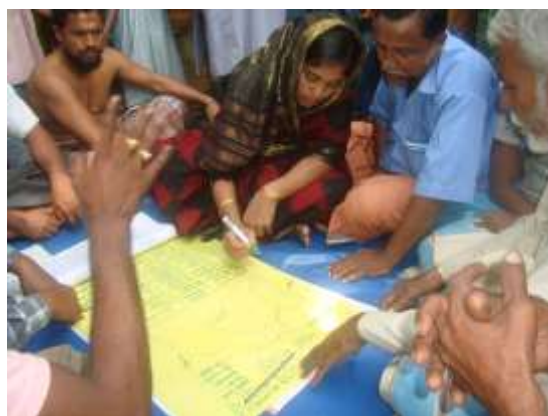
View of beneficiaries selection process