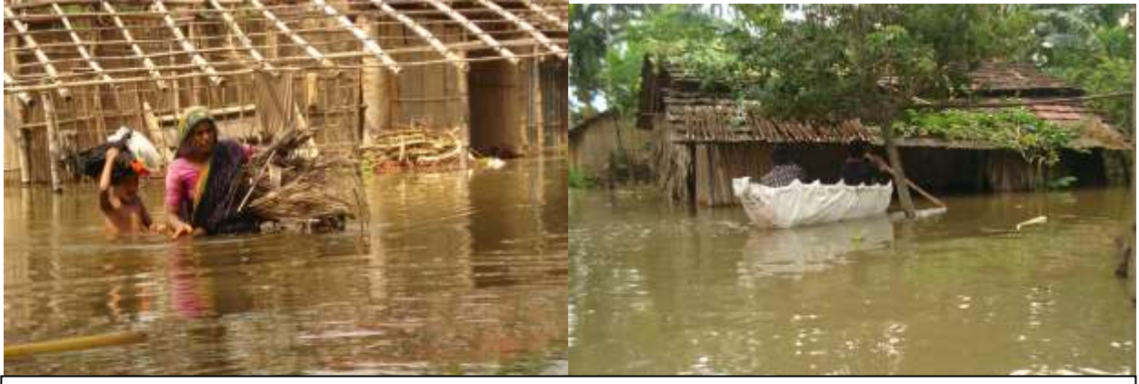
VIEW OF DISASTER OVER THE PROJECT AREA KALAROA UPAZILA

The Kalaroa Upazila has 12 Unions and 1 Pourasova with a total population of 224,834 (Female 109500 and Male 115334), consists of 119 villages and 37,467 households. The people of Kalaroa upazila are experienced in different type of natural hazards as well as a few man made hazards (which human trafficking is a major along with risks of HIV/AIDS in the area as it is boarder belt of India). There was no such assessment of risks associated with different hazards on the people, their livelihood and households, communities and nationals resource bases. The community people and DMCs played more reactive role after a hazard onset and tried to manage the disasters through relief and rehabilitation.