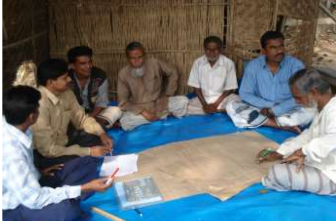
VIEW OF CRA SESSION WITH COMMUNITY PEOPLE